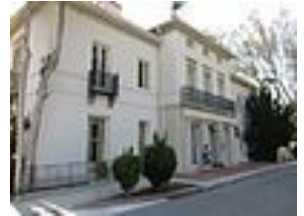
Thomas R. Bard Mansion