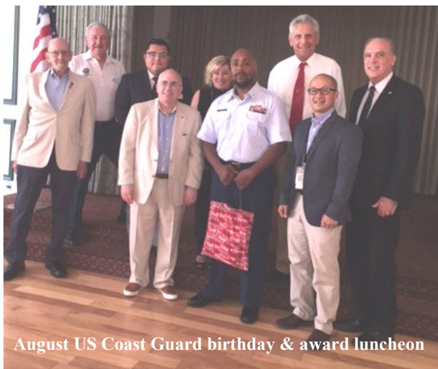
August US Coast Guard birthday & award luncheon