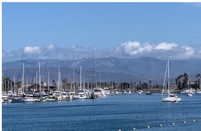
Beautiful sunny day at Channel Islands Harbor